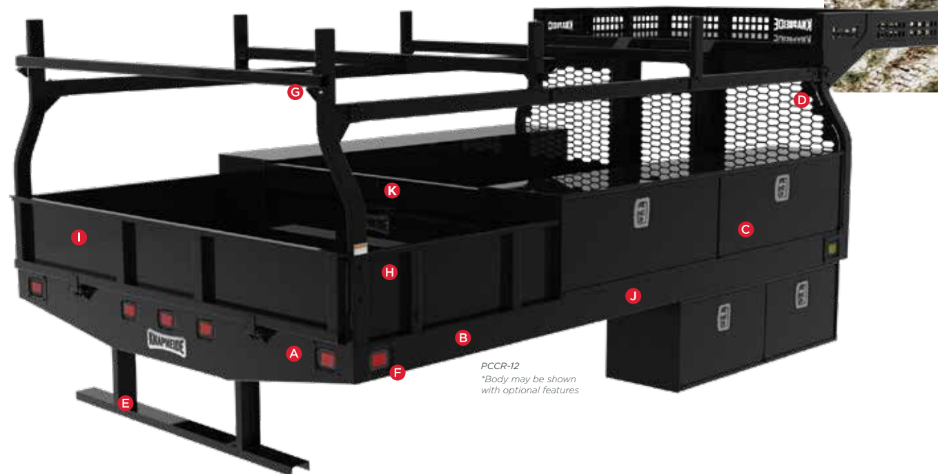
PCCR-12 *Body may be shown with optional features

Visit knapheide.com/quote and fill out the form to receive a quote and additional product information.